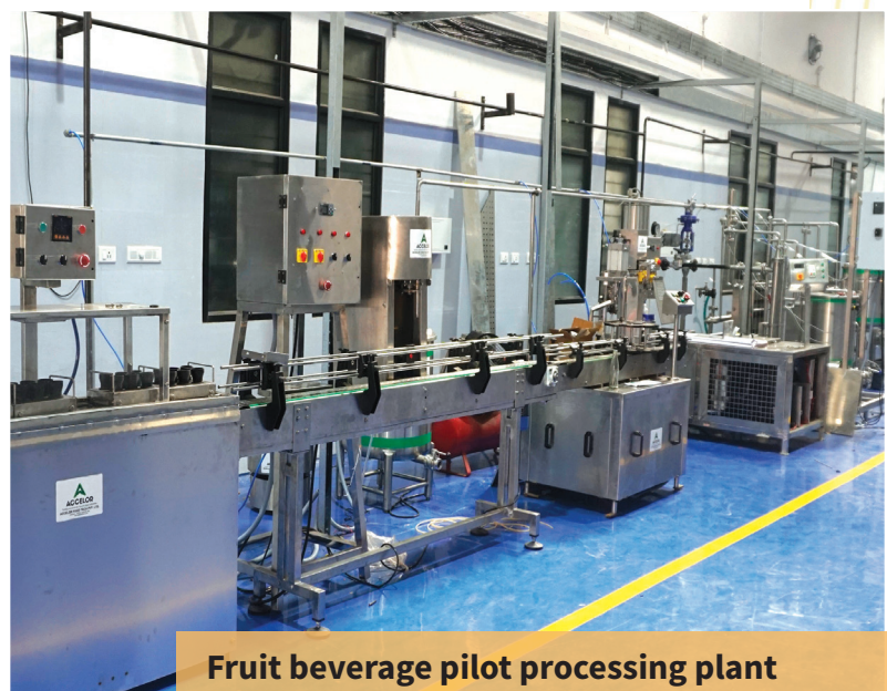
Fruit beverage pilot processing plant