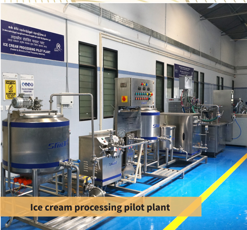
Ice cream processing pilot plant