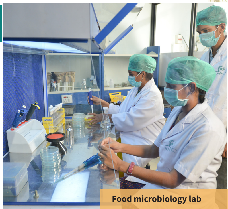
Food microbiology lab