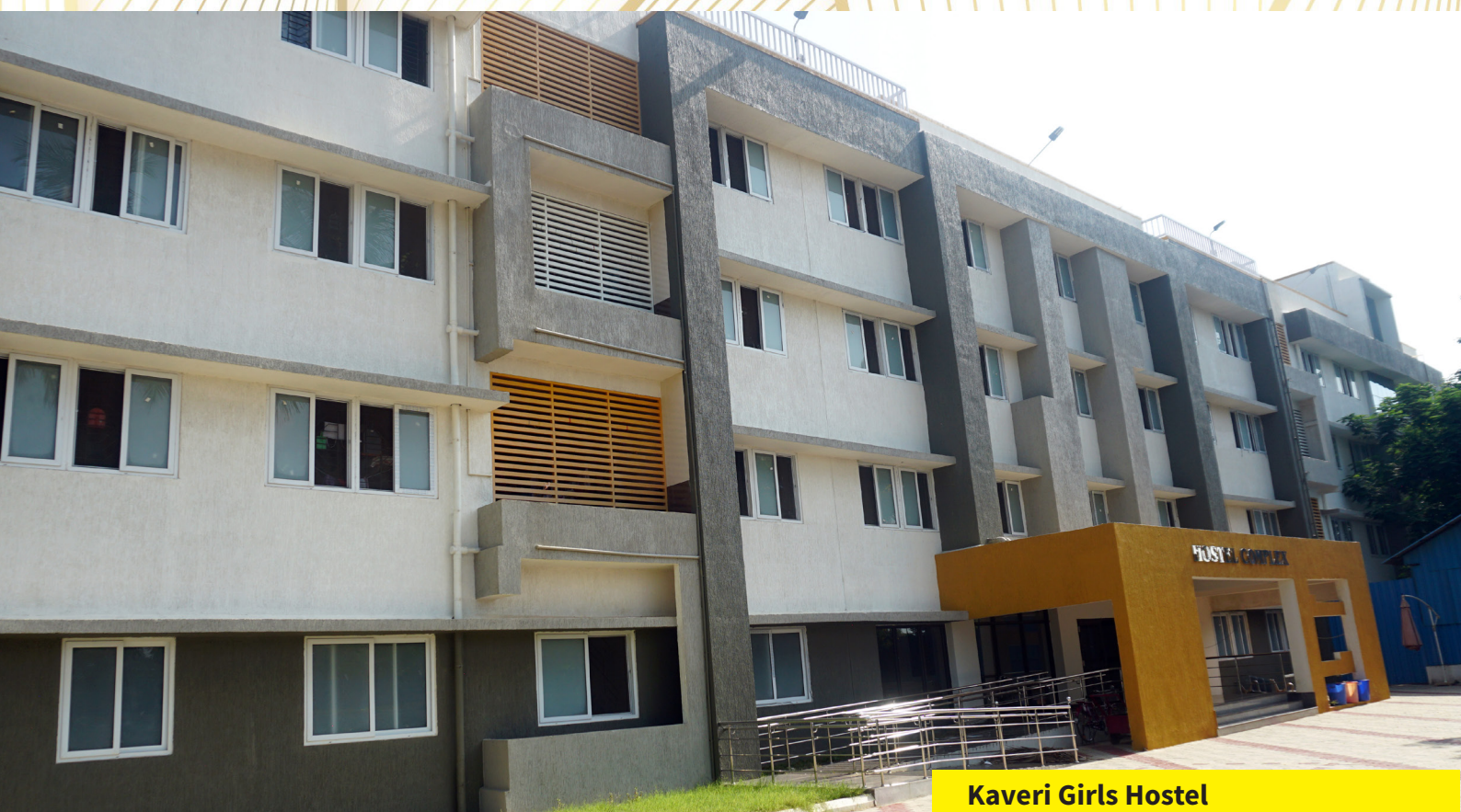
Kaveri Girls Hostel