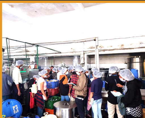
Students visit at Fruit Processing Industry