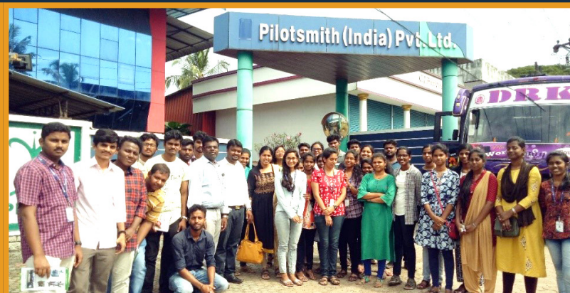
Students visits at Concor Pvt. Ltd and Pilotsmith Pvt. Ltd