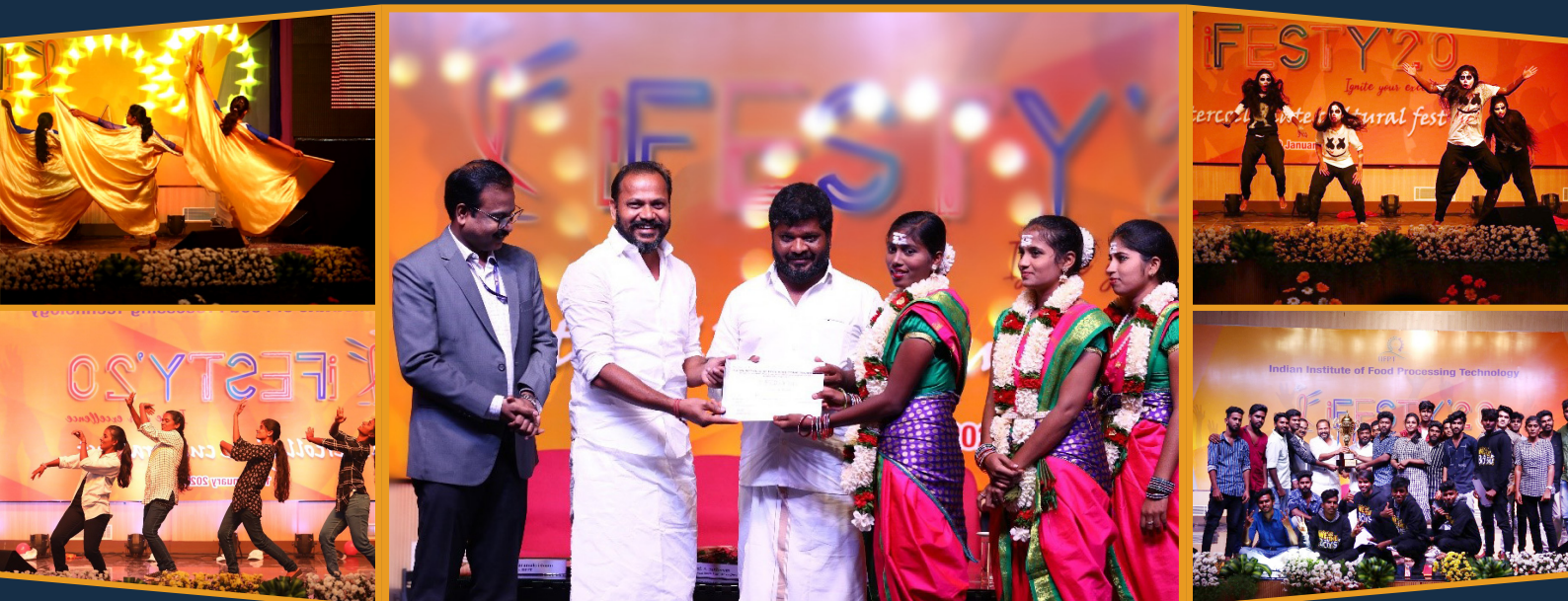
Enduring moments of iFESTY-20

A great intercollegiate cultural fest named as iFESTY was organized during 10-11 th of January. The complete program was structured, scheduled and organized by the students of IIFPT. Totally 20 different competitions like dancing, singing, painting, meme creation etc. More than 200 participants from 30 different colleges came and contested in the events. Overall championship was awarded to American college, Madurai, based on their best performance in many events. Mr.Sargunam, Tamil Movie Director, presided as chief guest during the valedictory function.