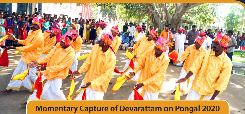
Momentary Capture of Devarattam on Pongal 2020