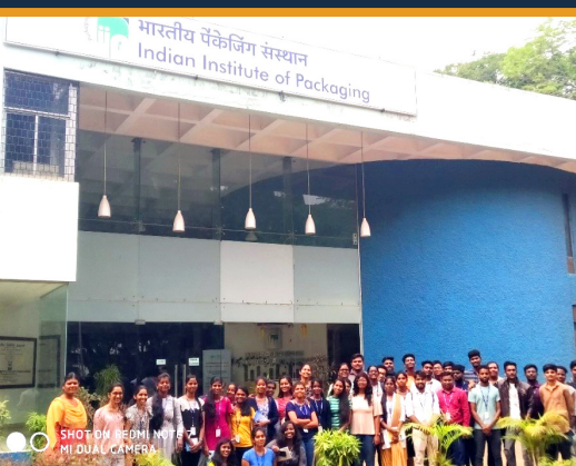
Students visit at Indian Institute of Packaging, Mumbai

As a part of curriculum, IV year students of B.Tech(FPE) went on All India Study Tour in Feb' 2020. They had visited around 15 food processing industries, from flour mill to baking industry, dairy to alcoholic beverage industry. They also had exposure about various Educational and R&D institutions across the country, like NIAM, Jaipur, AAU, Anand, ICAR-CPRI, Simla, ICAR-CIPHET, Ludhiana. The students had experienced the various places and different parts of our nation too.