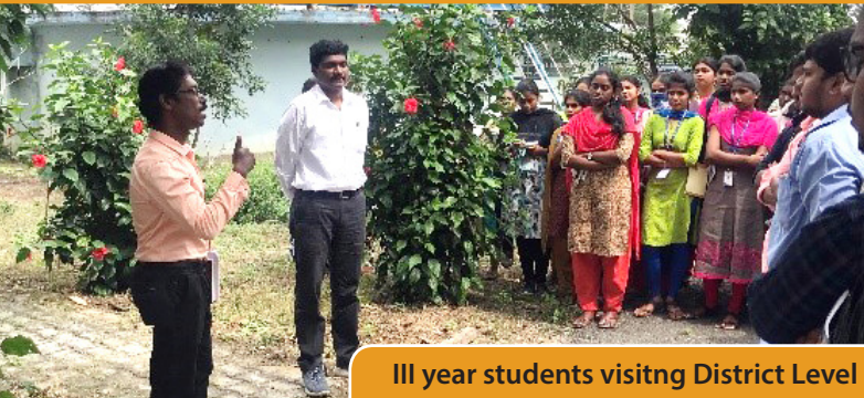
III year students visiting District Level Sewage treatment facility at Thiruvavur

Students of B.Tech and M.Tech are visiting various food processing industries and institutions as per the course curriculum and learnt practical experience on field of food processing.