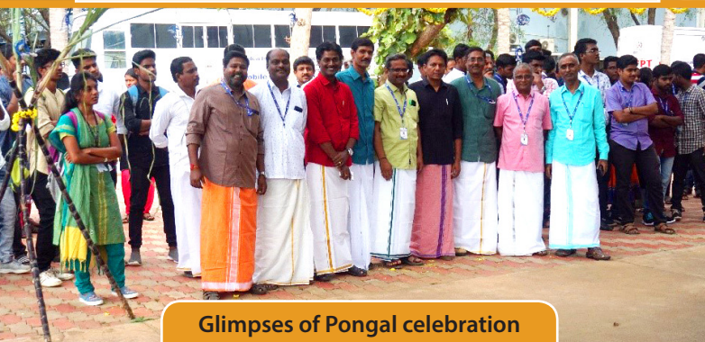
Glimpses of Pongal celebration

During 10 th of January, New year-Pongal 2020 was celebrated with the cultural cult in traditional way. Devarattam, Thappattam and Karakattam were the eye catching events during the Pongal celebration.