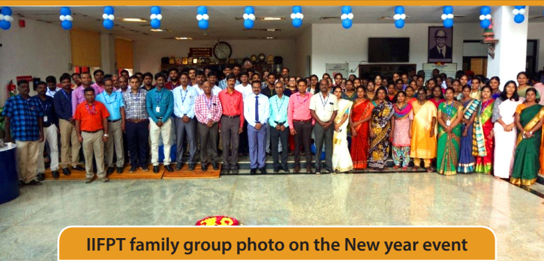
IIFPT family group photo on the New year event

IIFPT family jointly welcomed the new year 2020. The Director addressed the faculties and unveiled the Institute calendar for the new year