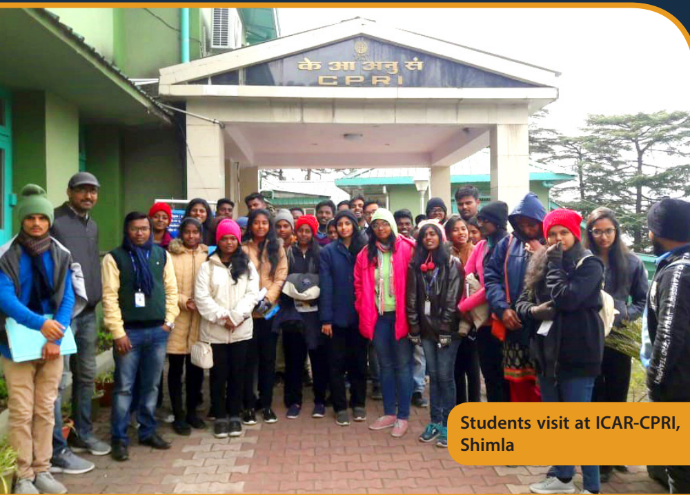
Students visit at ICAR-CPRI, Shimla