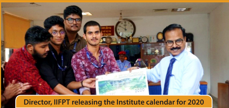
Director, IIFPT releasing the Institute calendar for 2020