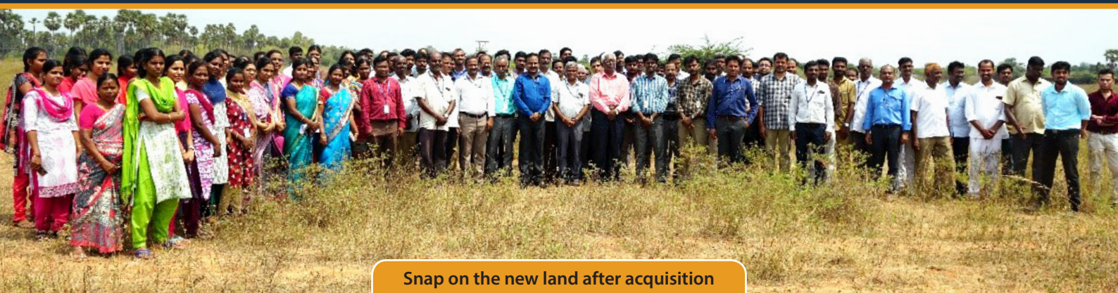
Snap on the new land after acquisition

The institute was striving for additional land for further expansion to meet out the nation needs in the field of food processing. Finally, IIFPT succeed in its longing desire by acquiring the adjutant land around 15 acres. Now the institute is on the track of expanding its infrastructure in a gigantic manner.