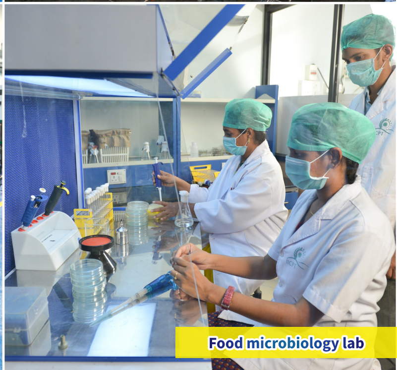
Food microbiology lab