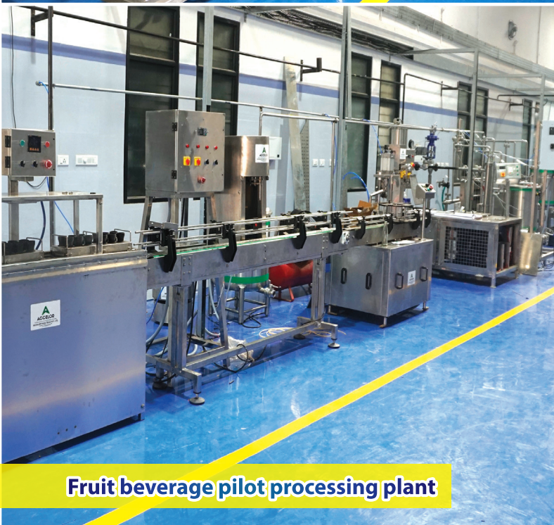
Fruit beverage pilot processing plant