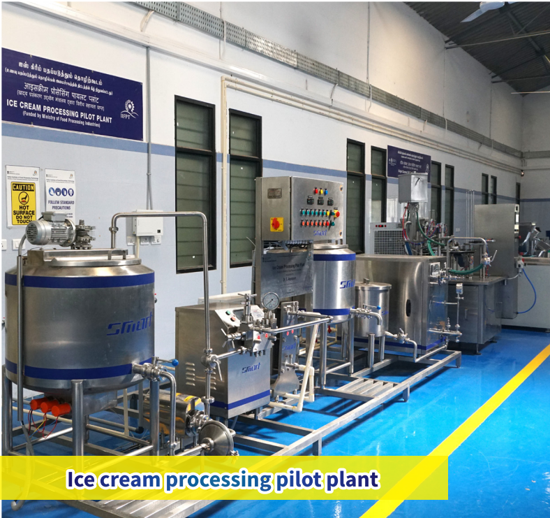
Ice cream processing pilot plant