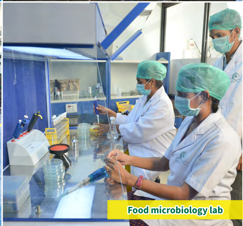
Food microbiology lab